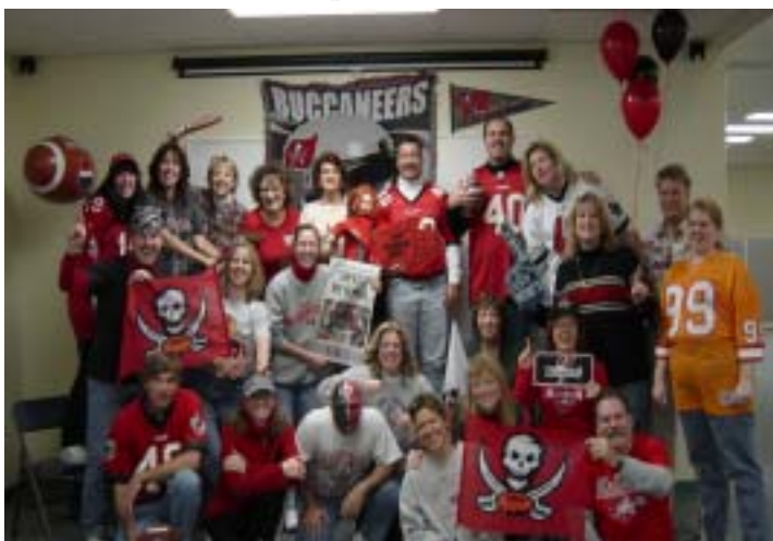
We had faith in our TAMPA BAY BUCS!!!